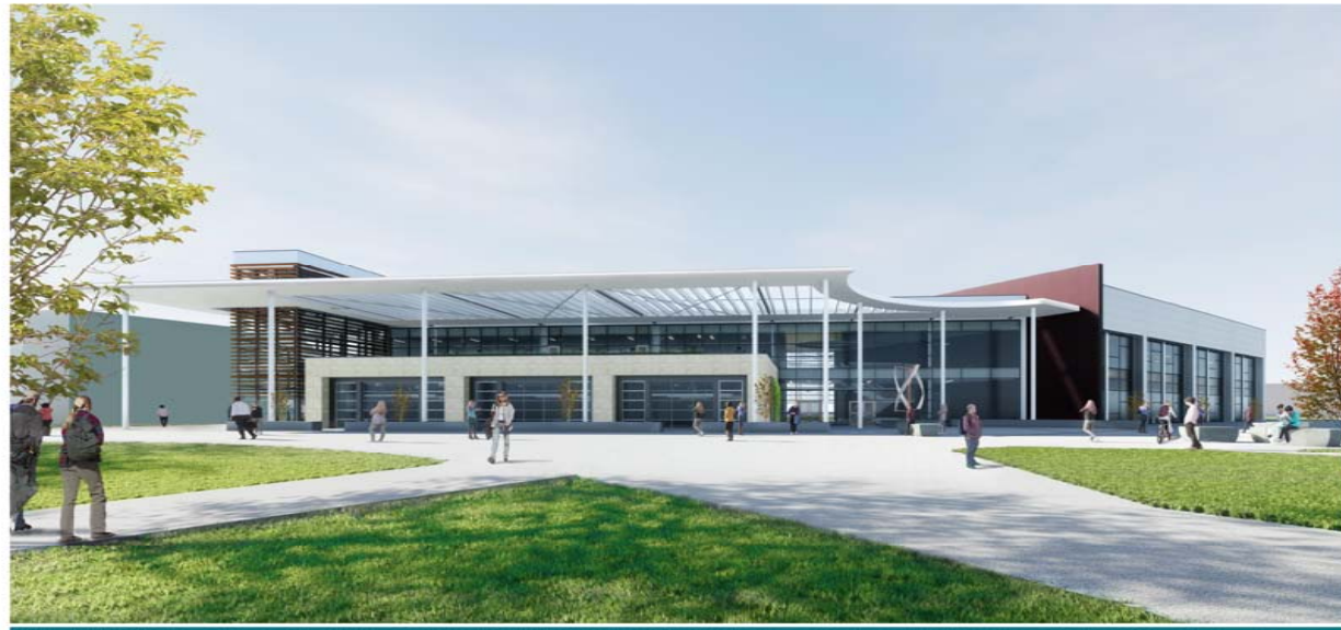
NORTH ELEVATION RENDERING MT REPLACEMENT BLDG